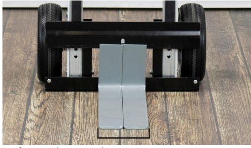
6" from edge to edge