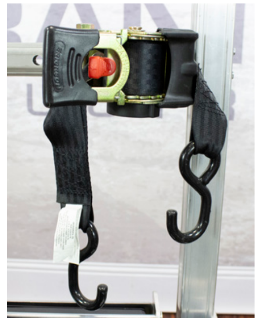
10'L x 2"W auto retracting ratchet strap.

RAPTOR HIGH PERFORMANCE ALUMINUM PRODUCTS