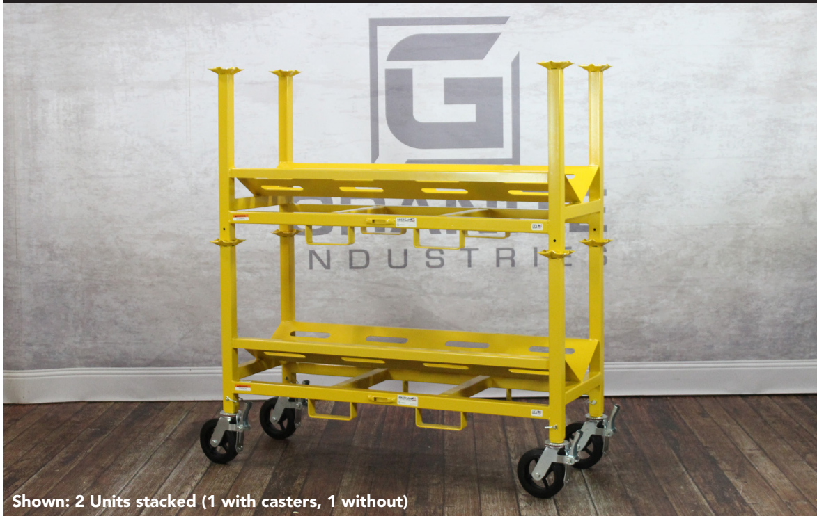
Shown: 2 Units stacked (1 with casters, 1 without)

67368 5' HOSE STORAGE RACK WITH 39" LEGS