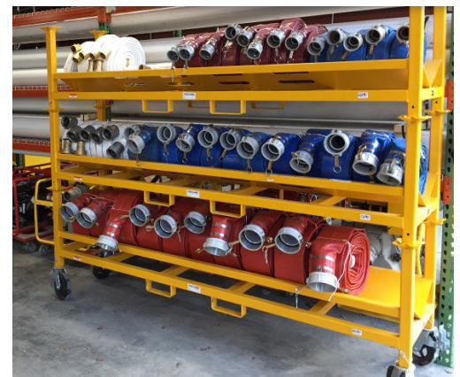
Three 8' Hose Storage Racks Shown. 33" legs.