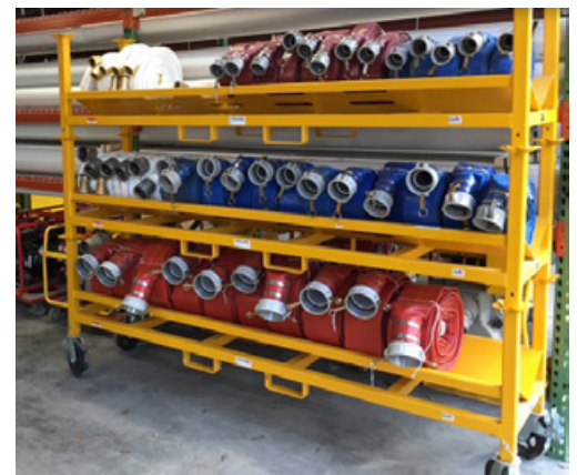
Three 8' Hose Storage Racks Shown. 33" legs.