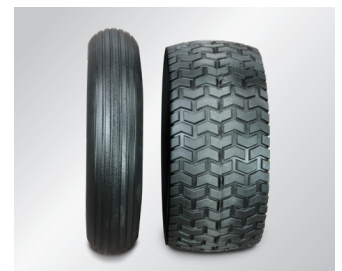
Left: Standard Tire (67154) Right: Wide Tire (67326)