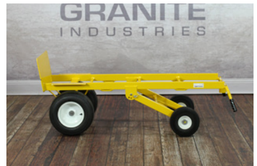
Adjustable wheel positions.