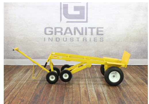
Shown with Trailer Dolly 67022-75.