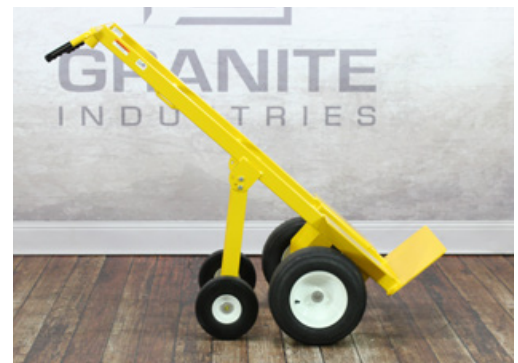
Adjustable wheel position.