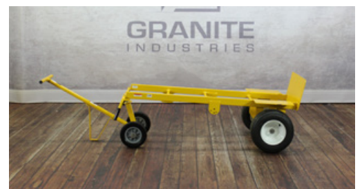
Shown with Trailer Dolly 67279-75.