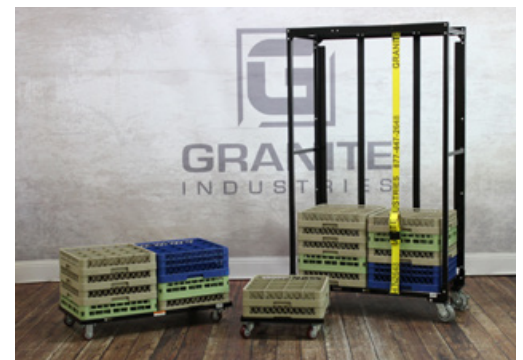
Other dish carts & dollies available.