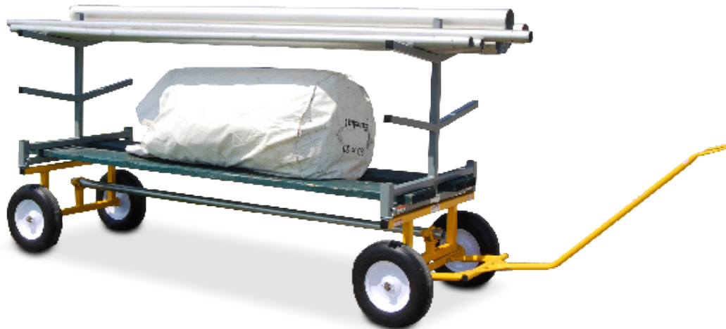
Tree add on shown installed on X-Country wagon