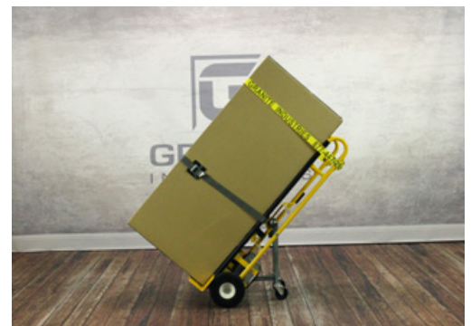
Shown with gray tie strap and yellow E-Strap.