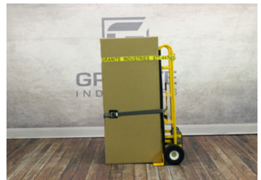
Shown with gray strap and yellow E-Strap.