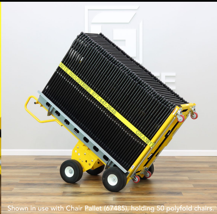
Shown in use with Chair Pallet (67485), holding 50 polyfold chairs.