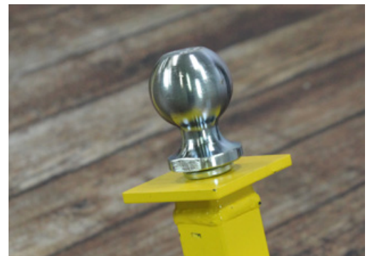
Shown with pintle hitch adapter installed.