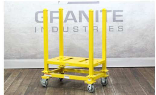
Pictured with 38" Rack 59360