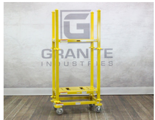
Pictured with 38" Rack 59360 and 28" Rack 59344