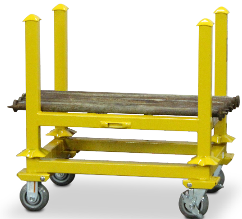
Pictured with rolling base 59337